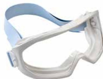
TPV frame providing a higher number of cycles in AUTOCLAVE sterilization at 134° C