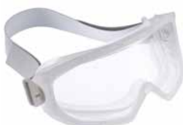
Ultra-ventilated TPR frame