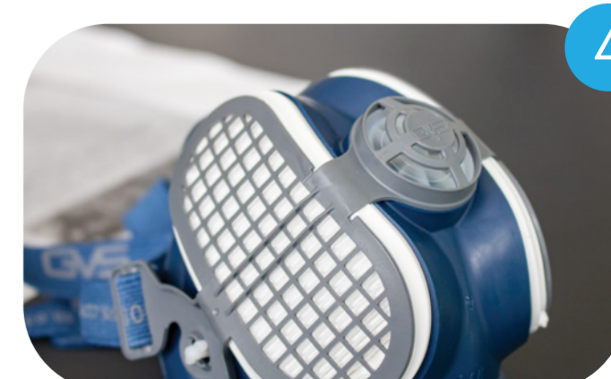
Remove the filter