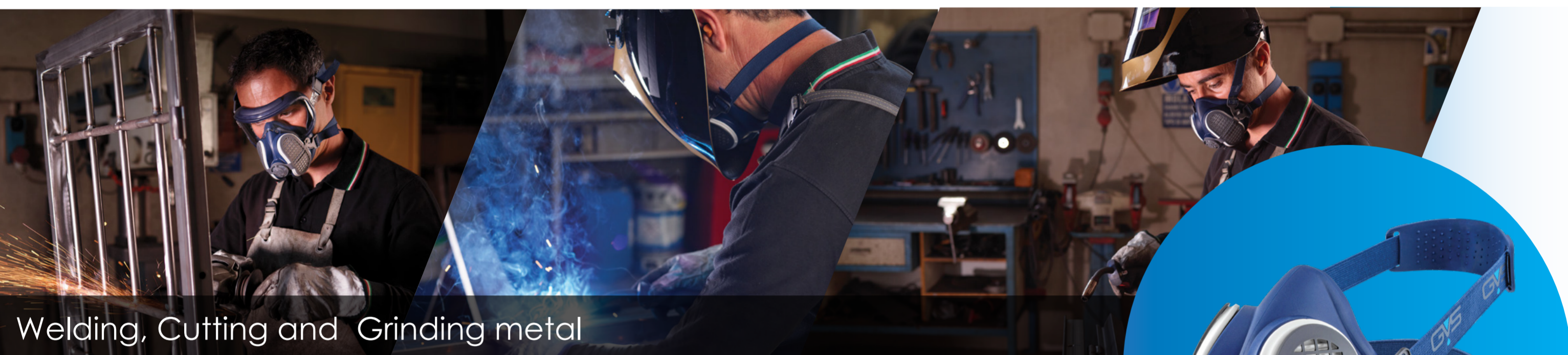
Welding, Cutting and Grinding metal

Fumes are formed when a solid material is vaporised by the high heat. The vapour cools quickly and condenses into very fine particles.